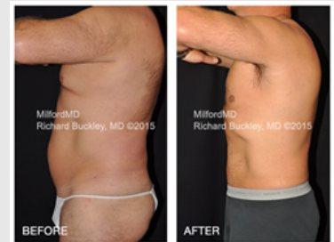
Before & after photo of Laser Liposculpture on abs, waist & hips on male patient performed while awake using tumescent anesthesia at MilfordMD Cosmetic Dermatology Surgery & Laser Center (Milford,PA)

MilfordMD offers patients a pallet of 39 different lasers, which can treat fat and loose skin, as well as address wrinkles and skin aging, from head to toe.